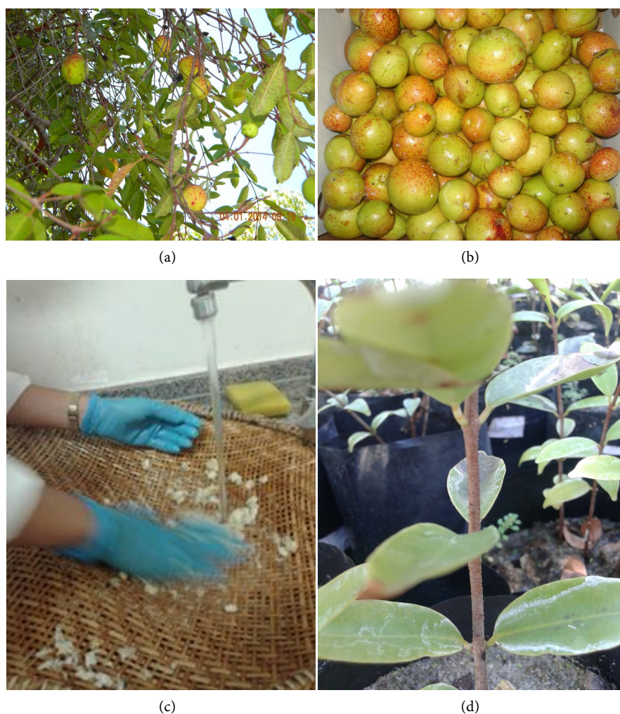
Figure 2. Mangaba fruits in tree (a), harvested (b), skimmed (c) and progeny (d).