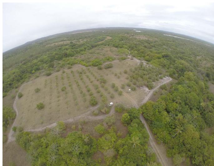
Figure 1. Aerial view of mangaba Genebank of Embrapa coastal tabulelands. Itaporanga d'Ajuda, Sergipe, Brazil.

PCR reactions were performed in 10 µL total volume; the reaction mix contained 1.0 µL of genomic DNA, 1.0 µL of 10× Taq PCR buffer, 0.8 µL of MgCl 2 (25 mM), 0.2 µL of dNTP (2.5 mM mix), 1.0 µL of each primer (5 mM, forward - 6-FAM and reverse—HEX) and 0.1 U Taq polymerase and 4.9 µL of ultrapure water. Thermal cycling conditions were 94°C for 1 min; 35 cycles of 95°C for 1 min, annealing temperature specific for each locus ( Table 2 ) for 1 min, and 72°C for 1 min. PCR products generated from a total of 87 samples of mangaba accessions/progenies were genotyped on a 3730 ABI Genetic Analyzer (Applied Biosystems, Carlsbad, California, USA) at the Interdisciplinary Center of