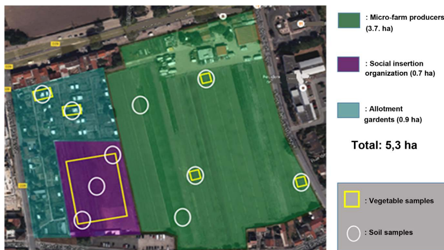
Figure 1. Site plan, soil and vegetable sampling strategy.

points on a diagonal of the plot. Each soil sample (10 in all) is a composite sample of 8 to 9 elemental samples (randomly taken from an area of 200 m 2 ) from the cultivated horizon (0 to 30 cm deep) taken by a hand auger.