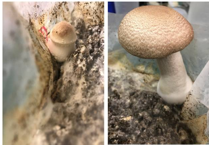
Figure 2. Primordial formation and fruit body development of almond mushroom.

(50%), corncob (25%), sawdust (75%), sawdust (50%) and sawdust (25%) respectively. These results suggested that spawn run did not necessarily reflect faster primordial formation and fruiting body development. It took 5 - 7 days from primordial formation to fruit body development and was in the range of 35 - 57 days for total day to the first crop.