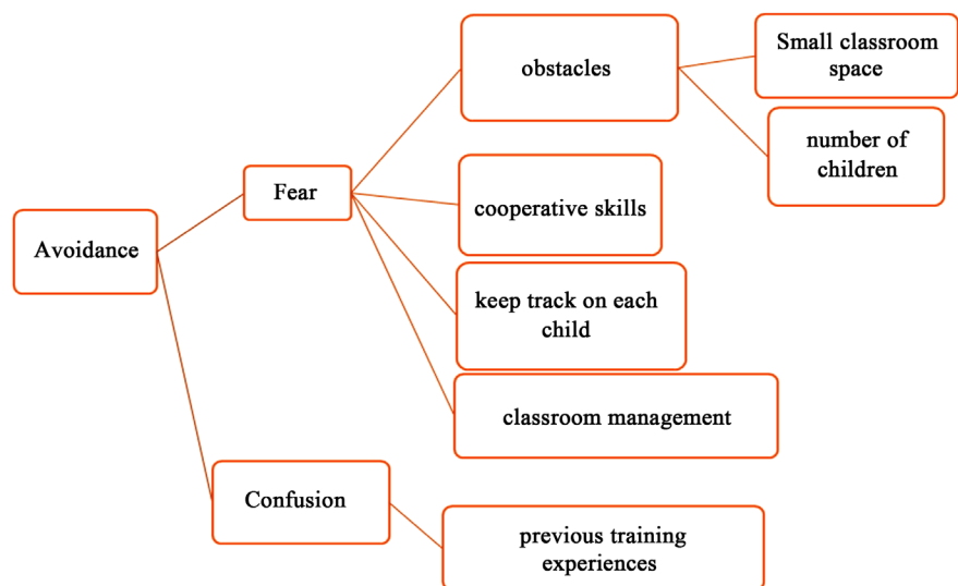
Figure 1. Reasons for teachers' avoidance to apply DI.

Content Analysis of the diary showed that every teacher followed more or less a specific journey to professional development (Figure 2). Particularly, at the beginning of the program they were questioning not only that this program would be effective, but also that DI was not applicable in the Greek kindergarten context (e.g. record on 10/5/2016: “...she was assertive that working in groups was impossible to happen in her classroom, because it was tight. She also seemed quite skeptical if DI is just another trend that doesn’t fit in the Greek reality”). After the first meetings, they started to feel nervous and sometimes denied to evaluate their children through systematic observation, seeing that it added heavy workload (e.g. record on 10/26/2016: “we talked for a while and she said she had a difficult time checking out the social skills of the kindergarteners. It took a long time for her to finish. She said exactly: I am not doing anything else!