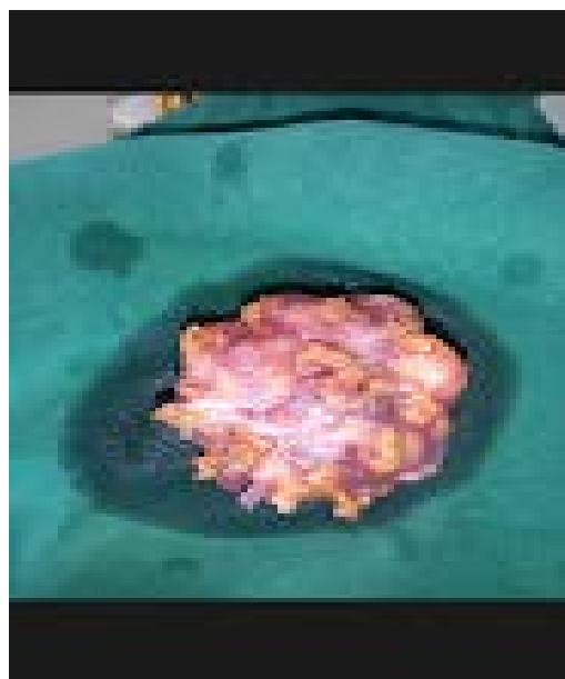
Figure 3. Excised Left parotid gland tissue.

mass excised. After resection of the parotid neoplasm, modified neck dissection was then added and the donor nerve graft was prepared from the great auricular nerve. Histological result showed features of adenocystic carcinoma of the parotid gland.