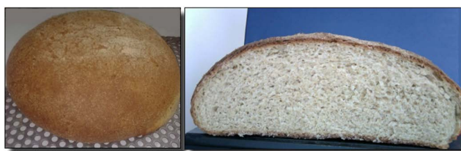
Figure 1. Wholemeal bread: cv. Cappelli.

a-d Mean in the same column followed by different superscript letters differs significantly ( p < 0.05 ).