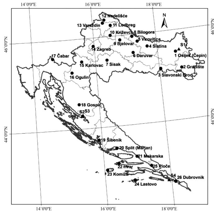
Figure 2. The main meteorological stations (MS) in Croatia with marked sites, where the cosmic photon dose and neutron dose were measured (results in Table 2 ). The figure shows particular sites S1, ..., S4, where the photon doses were measured (results in Table 1 ). The map shown in this figure was created using the ArcGIS software by Esri [12].

The examined linear correlation between the measured neutron dose rate N and altitude h showed that the belonging correlation coefficient was statistically significant and positive ( r = 0.36 ). So, variables N and h are correlated, and the linear regression equation is derived: