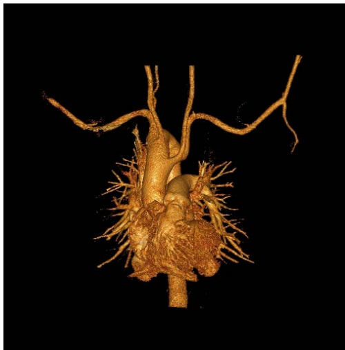
Figure 3. Volume rendered image of right aortic arch showing mirror image branching.