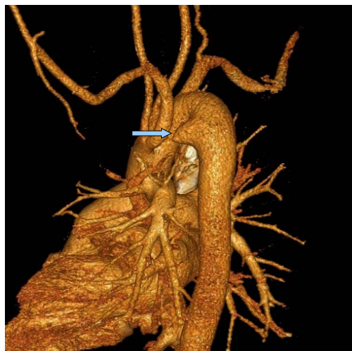
Figure 4. Volume reduced image of thoracic aorta showing aortic diverticulum (block arrow) from medial wall of aorta.