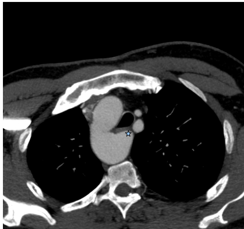
Figure 2. Axial contrast CT at the level of aortic arch shows Right sided aortic arch with an aortic diverticulum (asterix) along medial wall causing pressure effect over oesophagus/tracheoesophageal groove.