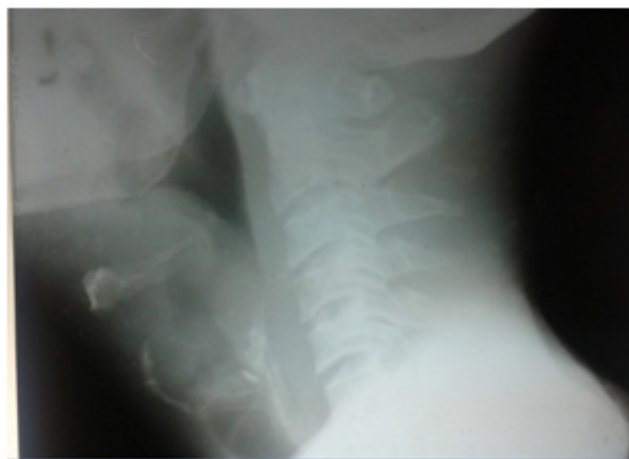
Figure 1. X-Ray STNL showing edema of the epiglottis (thumb sign).

In the post operative period, patient was stable and was managed with I.V (intravenous) third generation cephalosporins and I.V metronidazole. Culture report showed Klebsiella pneumonia growth, sensitive to ciprofloxacin, co-trimoxazole and ceftriaxone. Four days later, repeat video laryngoscopy was done which revealed a decrease in the edema of the epiglottis, enabling the visualisation of the laryngeal inlet which was found to be adequate. Three days later, another repeat video laryngoscopy revealed a near normal epiglottis ( Figure 5 ) with a healthy slough covering. Decannulation was done on the 10 th POD ( Figure 6 ) and the patient was discharged on the 14 th day ( Figure 7 ).