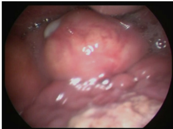
Figure 3. Edematous epiglottis with puspointing.