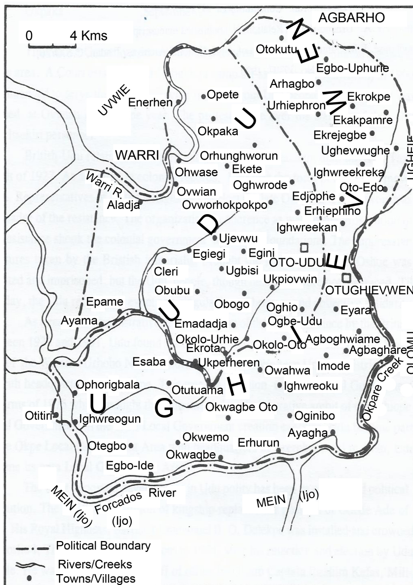
Plate 1. Map of Ughievwen showing the study area. ➤ Indicates study area.