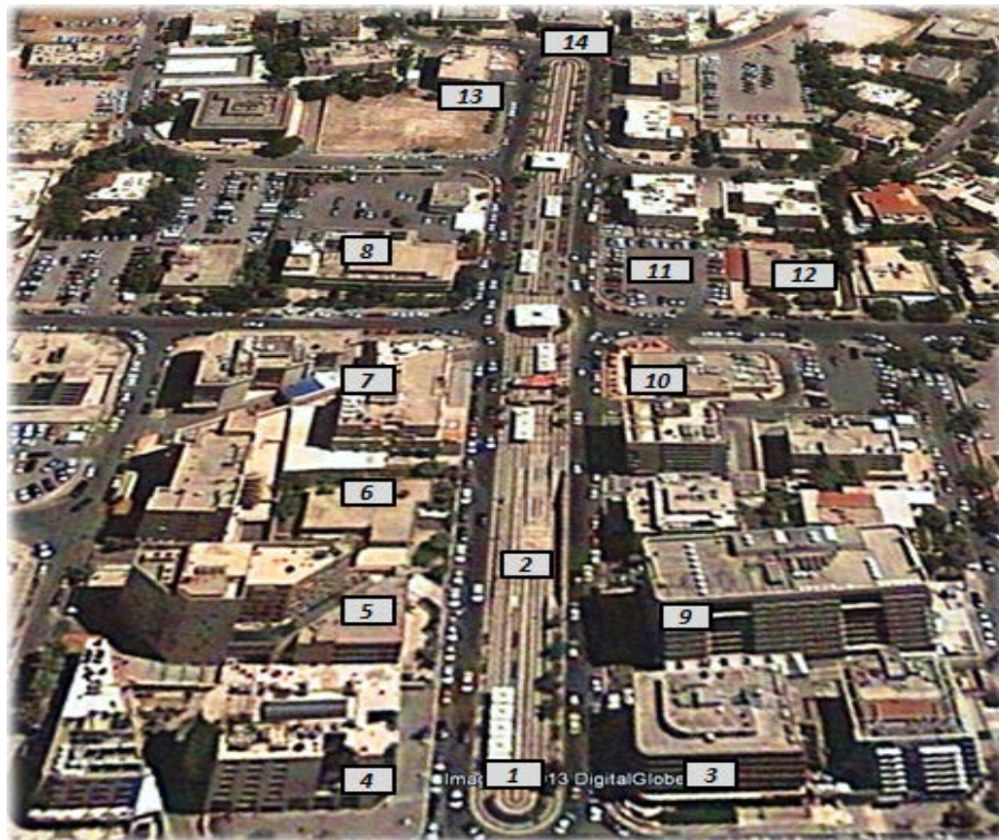
Figure 1. (1) Gathering Spaces; (2) Sunken Gallery; (3) Nokia Center; (4) Oracle Tower; (5) Arab Jordan Investment Bank; (6) Commercial Building; (7) Commercial Building; (8) Commercial Building; (9) Islamic Bank Building; (10) Restaurant; (11) Parking; (12) Houses; (13) Commercial Building; (14) HSBC Bank (The Authors, 2014).

cial phenomena in urban space. With 70 \times 20 m of media display, dance, graphics, sound & architecture have been played (Figure 2). The concept created by Till Botterweck, spacing is a principle that translated into specific aspects of the folk dance by 3D-video-mapping, The Direct projection on the facade is forced audience to move to the right and left during the presentation, this project put facade in narrative within urban space [32].