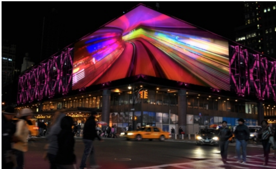
Figure 5. Authority bus terminal, LED media display, New York, United States (Alison, 2011).