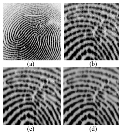
Figure 3. Comparisons of the de-noising results for the TNLM and NLM-LOF operating on a real fingerprint image. a. original image, b. zoomed view of the labeled region, c. result with TNLM, d. result with NLM-LOF.