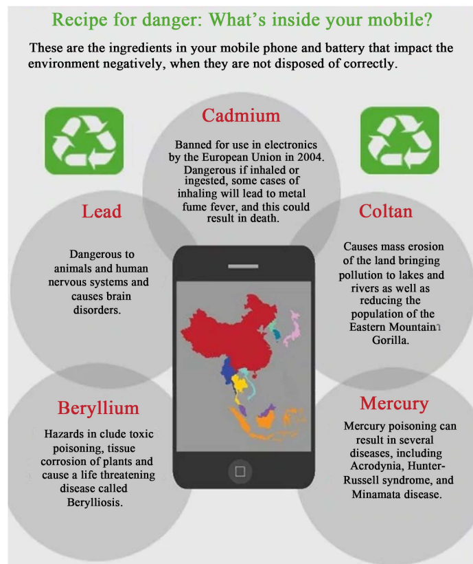
Figure 2. Chemical substances in mobile phones.

Most mobile phones contain precious metals and plastics and when placed in a landfill, these materials can pollute the air and contaminate soil and drinking water. Heavy metals such as cadmium, lead, lithium, and mercury are some of the many materials used in the manufacturing of mobile phones (Figure 2). A ton of used mobile phones for example contain about 3.5 kg of silver, 340 grams of gold, 140 grams of palladium, and 130 grams of copper and an average mobile phone battery contains another 3.5 grams of copper [3]. Coincidentally, an unusually high incidence of leukemia, lymphoma, brain cancer, and other serious diseases appears to exist among relatively young people who have worked in the factories that manufacture mobile phones [4]. Similarly, chemical slurries created in the process of extracting these raw materials contaminate groundwater creating severe environmental hazards.