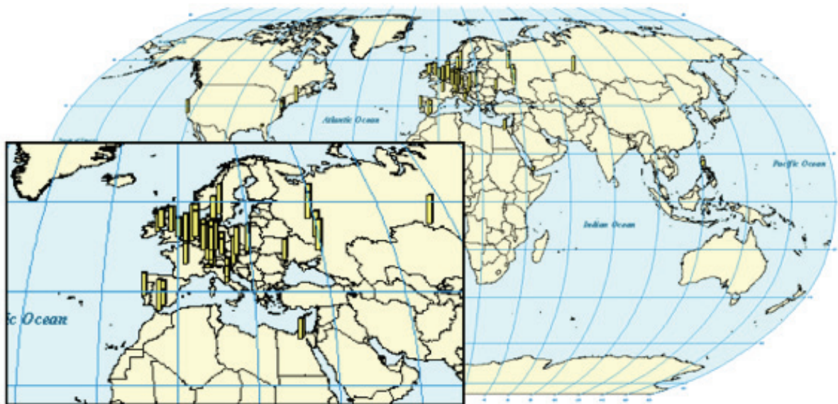
Figure 2. Interconnection geographical distribution at the MIX.

The Moran's I index of autocorrelation, as reported in Table 1 below, supports a random distribution for interconnection agreements at each of the three Italian IXPs: