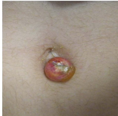
Figure 1. Pre-operative photograph of the umbilical mass.

Epidermal cysts are common, benign skin tumors usually involve the scalp, face, neck, back, and trunk [1]. A cyst may rupture, and extrusion of its keratin into the dermis may incite a foreign body reaction [2]. Epidermal cysts are usually asymptomatic unless they get infected or