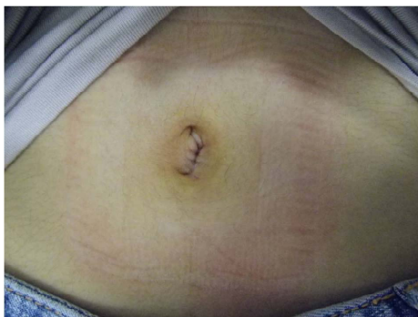
Figure 3. Post-operative photograph of the umbilicus.