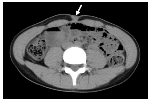
Figure 2. Magnetic resonance imaging of the abdomen showing a subcutaneous mass, not communicating with the abdominal cavity (see mass adjacent to white arrow).