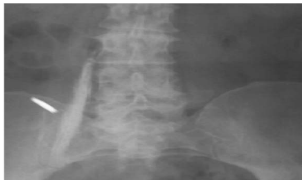
Figure 1. Radiographic view of iohexol spread with psoas muscle confirming optimal placement of catheter tip.

The removal of each lumbar plexus catheter was scheduled on postoperative day 3, without any consideration of the INR value. Removal was performed by the nurse assigned to the care of the patient. After the removal of the perineural catheter, the nurse was instructed to monitor the patient for clinical evidence of perineural hematoma (pain at the site, morphologic changes) and neurologic deficits. Serial hematocrit levels were also followed by the medical staff and any acute decrease was followed with a diagnostic CT scan. Incidence of DVT was documented with the assistance of lower extremity