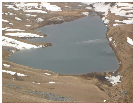
Figure 7. Lake Parmi: Photo by Saroj Panthi.