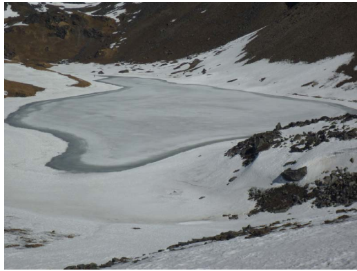
Figure 6. Lake Laden Second: Photo by Saroj Panthi.