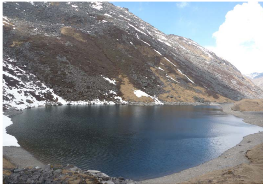
Figure 2. Lake Bhujunge: Photo by Ramesh Poudel.