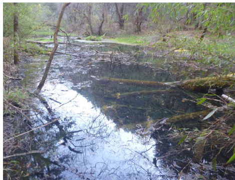
Figure 3. Lake Ganaune: Photo by Saroj Panthi.