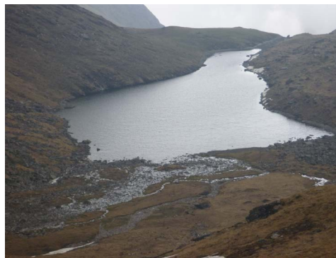
Figure 4. Lake Jalpa: Photo by Pradeep Poudel.