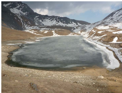
Figure 12. Lake Warmi: Photo by Saroj Panthi.

more than 17 hectares area. Local herders pray to god of this lake to save own cattle from wild predator. Lake Laden first is situated at highest elevation. Most of the lakes are situated in Rukum district ( Figure 13 ). Only one lake is situated in Myagdi district. Lake Rakesh is smallest lake covering only 291 m 2 but having the religious importance. Most of the lake area falls on the elevation range between 4400 m - 4800 m ( Figure 14 ). No any lake is recorded in more than 4800 m elevation and only one lake Ganaune (bad smelling) is recorded in below 3800 m elevation.