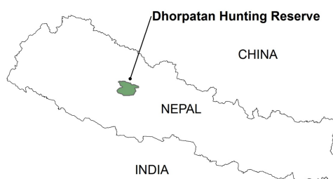
Figure 1. Dhorpatan Hunting Reserve.

We collected the GPS points of boundary of famous lakes. We recorded elevation by the help of GPS and we