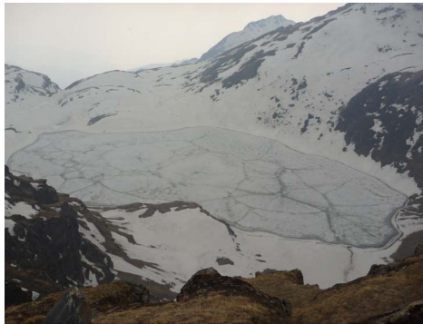
Figure 11. Lake Sundaha: Photo by Saroj Panthi.