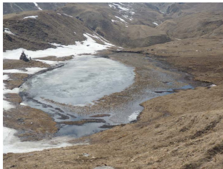
Figure 8. Lake Pupal