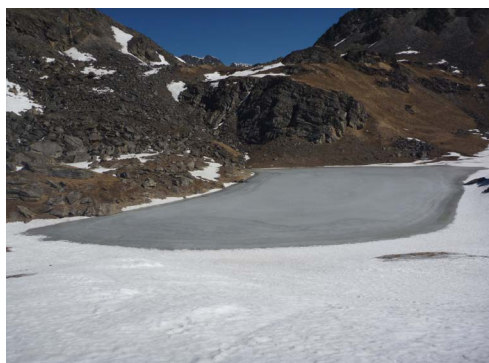
Figure 5. Lake Laden First: Photo by Saroj Panthi.