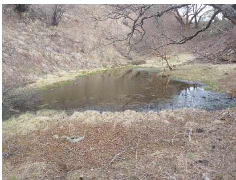
Figure 9. Lake Rakesh: Photo by Saroj Panthi.