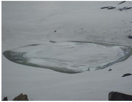
Figure 10. Lake Rakshes: Photo by Saroj Panthi.