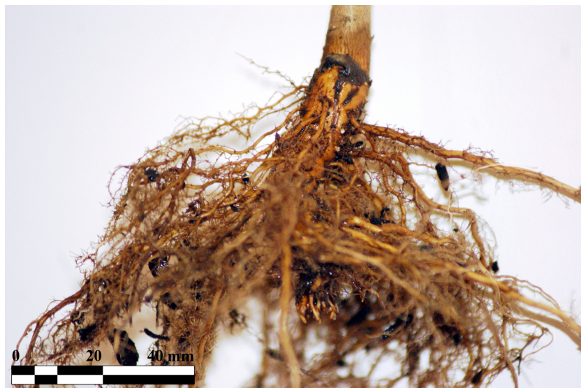
Figure 2. Roots of a swamp white oak seedling after having been stepped up to a 1 L pot with air-root-pruned taproot(s) and extensive development of many first-order lateral roots along the taproot immediately below the root collar.

In the fall of 1995 and 1998, acorns that had been placed in plastic bags and stored for 4 weeks in the walk-in cooler were sown at a nominal 200 acorns·m -2 in a conventional nursery bed at the Forrest Keeling Nursery. Nursery beds were covered with 5 cm of mulch during overwinter stratification. Before 1.2-m wide raised nursery beds were created, 1000 kg·ha -1 of 28-14-14 NPK fertilizer was tilled into the silty loam soil. An additional