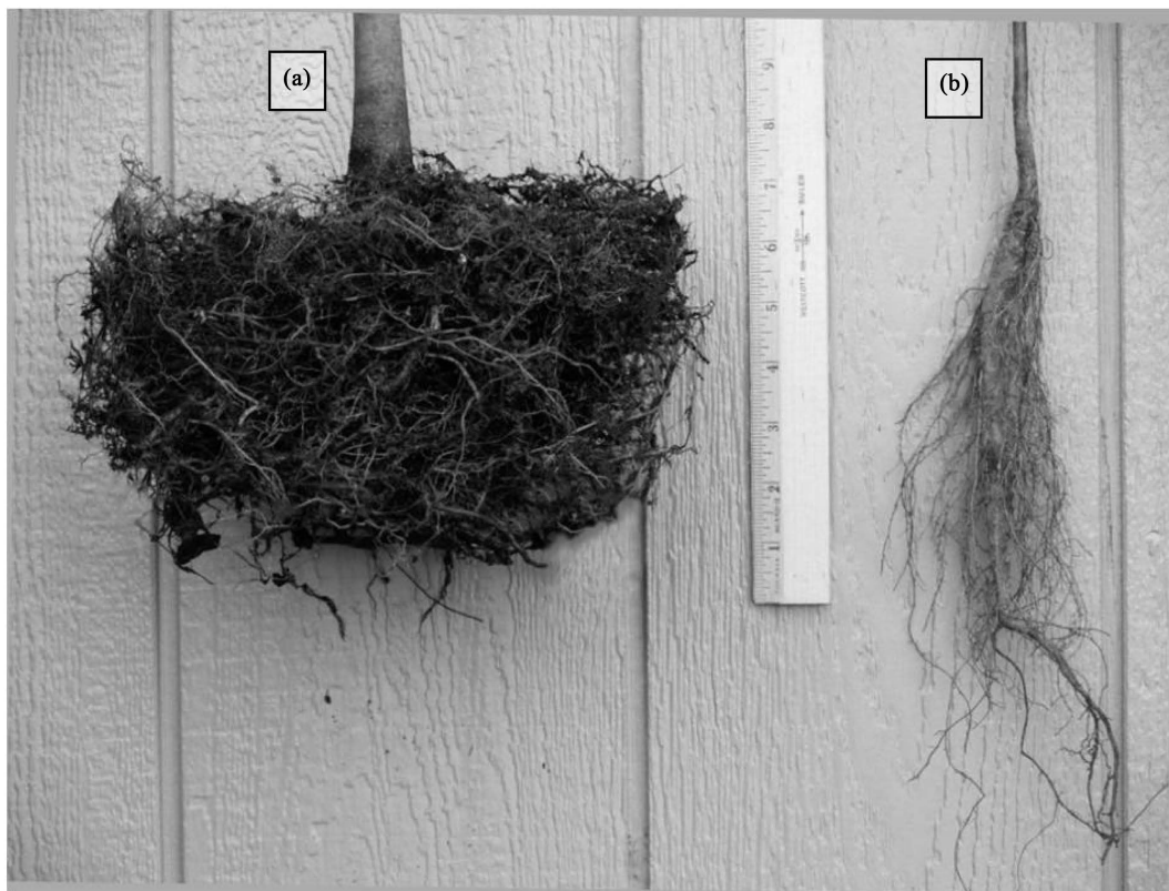
Figure 3. Comparison of root development after one growing season in the nursery between repeatedly air-root-pruned container-grown (a) and bareroot nursery-grown (b) seedlings of swamp white oak (ruler length is 24 cm).

After 11 years, swamp white oak trees established as air-root-pruned container planting stock were 1.4 times taller and had 1.8 times greater dbh than trees from the bareroot planting stock (Table 2). More importantly, whole-tree and stem-only green weights were 4.1 times and 3.5 times greater, respectively, for the trees from the container stock than from the bareroot planting stock. Although both stock types were heavily graded to meet minimum size requirements as specified in the cost-share agreement to establish the planting, the container planting stock was more than 3 times larger for both height and basal caliper than the bareroot planting stock that came from the state-run nursery. At both the Plowboy Bend CA and Cuivre Island CA, the trees from container stock had a greater percentage change in diameter growth than height growth and lower height-to-diameter ratios (50:1 and 43:1 for container and 74:1 and 55:1 for bareroot planting stock at Plowboy Bend CA and Cuivre Island CA, respectively) than the trees from the bareroot stock. Because root growth is highly correlated with diameter growth, the changes in height-to-diameter ratios indicate the container planting stock also had greater root growth. Although no swamp white oaks were excavated at either site, an excavated four-year-old sapling of northern red oak ( Q. rubra L.) showed extensive root development and persistence for many of the lateral and multiple taproots initiated during air-root pruning (Figure 4).