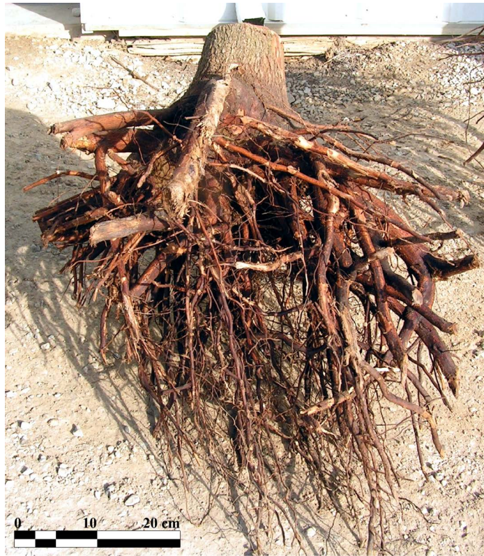
Figure 4. Root architecture of a 4-year-old northern red oak sapling established as a repeatedly air-root-pruned container-grown seedling showing extensive development of horizontal lateral roots near the soil surface and multiple vertically-oriented taproots.