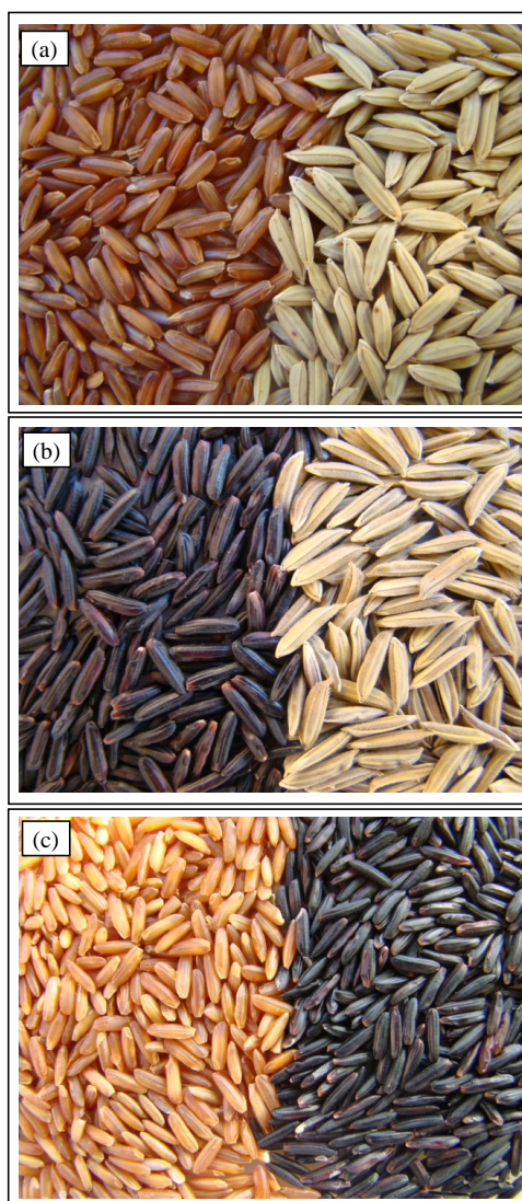
Figure 3. Morphological aspect of whole and husked grain of SCS119 Rubi (a), SCS120 Onix (b) and the contrast between the two varieties (c).

The development of varieties of colored pericarp by Epagri Rice Project is part of an initiative to offer a portfolio of specialty rices covering varieties of red and black pericarp, aromatic and glutinous types destined to specific market niches. Products associated to this special niches, have also a higher market value when compared to the traditional products. This also happens with rice, with specialty rices owing in some case more than ten times the value of the traditional white rice.