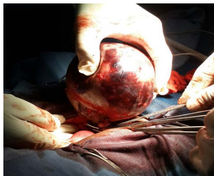
Figure 1. Right adnexectomy.