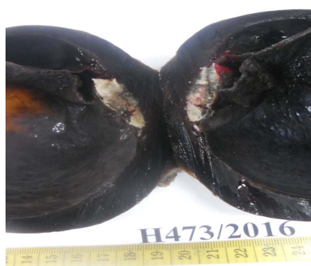
Figure 2. Macroscopic aspect to dissection.

Conclusion: Cystic mature teratoma (dermoid cyst) of the right ovary with necrotic-haemorrhagic reshuffling, compatible with a torsion.