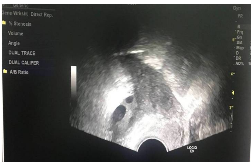
Figure 2. The image of transvaginal ultrasonography at 18 months postpartum.

persistent, bleeding of less than 1000 ml during CS. Neither of these patients developed any noticeable uterine involution by 3-week postpartum and uterine evacuation produced no findings, although there were abnormal intrauterine echoes on ultrasonography. Although our patient was treated without removing the uterus, the other patient underwent a hysterectomy at 2-month postpartum [9]. Some gynecologists may argue that the decision to place a B-Lynch suture may have been unwarranted for both women, because surgical intervention is usually suggested only for cases in which uterine massage, uterotonics, and balloon tamponade have failed [10]. Previous research has reported adoption of B-Lynch for blood loss of 300 ml, which may be conducted by younger, less experienced obstetricians [6]. The indication(s) for the B-Lynch suture should be re-visited, and surgical skills should be perfected via simulation training.