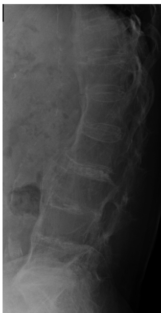
Figure 1. Lateral plain X-ray image at the first hospital visit. Ossification of the anterior longitudinal ligament was confirmed in a wide area from the thoracic vertebrae to the lumbar vertebrae.

MRI showed a fracture line passing from the ossified area of the anterior longitudinal ligament at Th12/L1 level through the inferior border of the Th12 vertebral body. Based on these findings, the patient was diagnosed as having a bone fracture of DISH caused by a slight external force ( Figure 2 ).