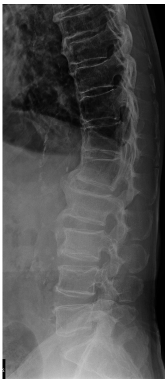
Figure 4. Lateral plain X-ray image obtained at the first hospital visit. The irregular end plate was confirmed on the inferior border of the L3 vertebral body and the superior border of the L4 vertebral body.

Plain X-ray images taken 6 months after the development of the bone fracture showed clear crush of the L3, L4 vertebral body, and formation of a callus in the anterior longitudinal ligament. Flexion-extension radiograph