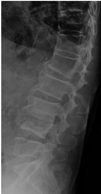
Figure 6. Plain X-ray findings obtained 6 months after bone fracture. L3, L4 vertebral body was crushed, but formation of a callus was confirmed in the anterior longitudinal ligament.

effects for osteoporosis-derived spinal compression fracture [11-13]. In addition, several recent reports have suggested that teriparatide would exhibit efficacy to promote healing of bone fracture and pseudoarthrosis by aggressively stimulating osteoblasts to promote bone formation [14-17].