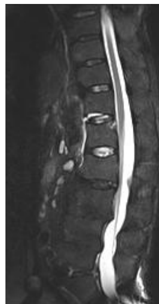
Figure 2. Sagittal STIR image of lumbar spine MRI. T1-weighted image shows a linear low intensity area along the end plate on the Th12 caudal vertebral body, whereas the T2-weighted image shows a linear high intensity area. In the STIR image, a high intensity area was confirmed from the area along the anterior border of the caudal vertebral body.

The patient had a history of type II diabetes, Chronic