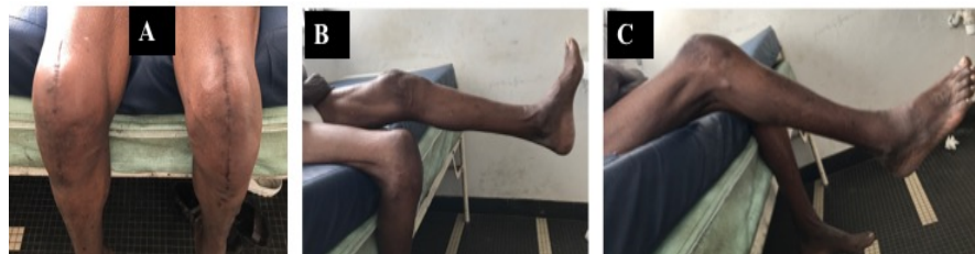
Figure 3. Functional evaluation at 8 months post-operative (A) knees flexion; (B) and (C) left and right residual flossum.