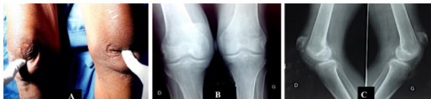
Figure 1. (A) clinical aspect of the knees, bilateral anterior depression; (B) and (C) radiographic aspects of the knees, bilateral patella alta, best viewed on profile.

The diagnosis of old patellar’s tendon rupture was retained and a surgical indication posed. The intervention was realised in two operating times separated by 04 weeks. The surgical approach was anterior following Krackow’s technic (trans-osseous tendon reinsertion inside patella) associated to a metallic strapping in eight number ( Figure 2 ). For the analgesic aim, we placed a posterior