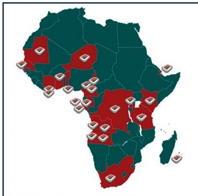
Figure 1. Made in China Sports Stadiums' Map, a. Afrique, La Tribune (Bayo, 2017).

All these kinds of diplomacy, linked to the African debt, could be assimilated to the debtbook diplomacy that worries the International Monetary Fund (IMF) and the World Bank (WB).