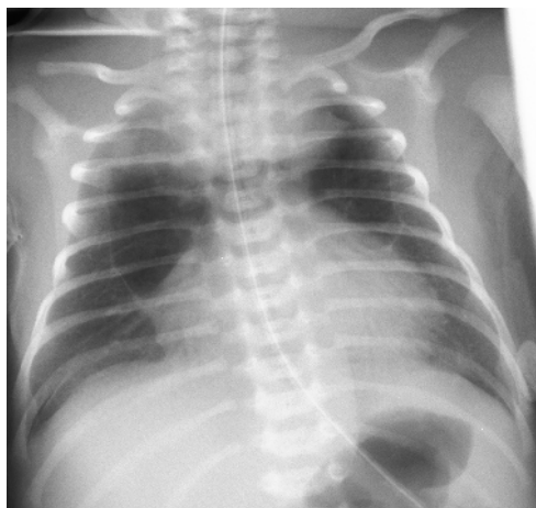
Figure 1. Chest x-ray on admission showing cystic appearance and Spinnaker sail sign of pneumomediastinum.

a classical Spinnaker sail sign of a pneumomediastinum ( Figure 1 ) with an otherwise normal appearance of the lung fields. Conservative management in head box oxygen resulted in complete resolution of the pneumomediastinum over the subsequent 72 hours ( Figure 2 ).