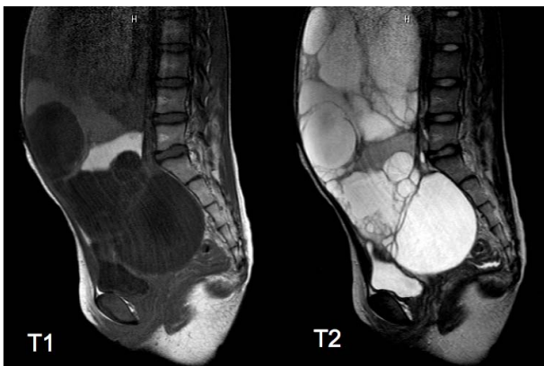
Figure 2. Magnetic resonance imaging of the lesion, showing high intensity on T1-weighted imaging and the low intensity on the T2-weighted imaging.

because the right ovary and bilateral adnexa appeared normal. The tumor measured 26 × 18 cm and weighed 5860 g ( Figure 3 ). Intraoperative frozen section of cystic wall showed mucinous cystadenoma. Microscopic examination after the operation showed multilocular lesions with a papillary structure displaying multiple layers