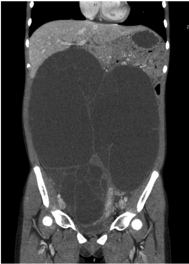
Figure 1. Abdominal contrast-enhanced computed tomography showing a large, multilocular tumor with clear boundaries spreading throughout the whole abdominal cavity from the right upper quadrant to the pelvic cavity.