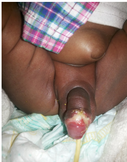
Figure 3. Early post operative outcome.