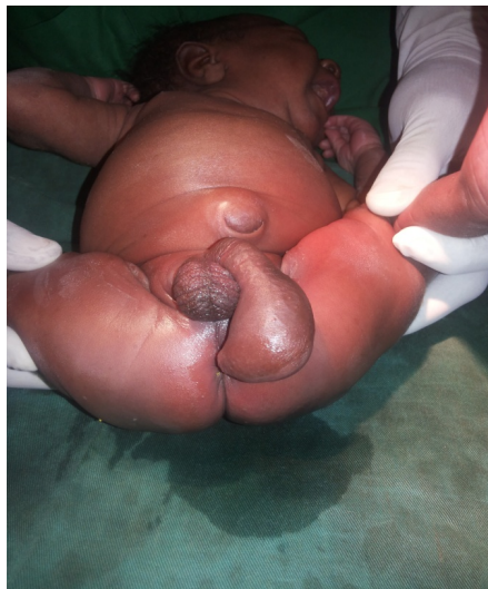
Figure 1. Anterior urethral valve showing bulging glanular urethra.

Patient was evaluated with ultrasound which showed thickened urinary bladder and moderate hydro ureters with normal renal function. He had catheterization, parenteral antibiotics (oral amoxicillin 50 mg/kg and later parenteral ceftriaxone 50 mg/kg) and had excision of the diverticulum and glanuloplasty. He did well post surgery and repeat renal function assessment remained normal with adequate urinary stream. At three month of post excision, there was no episode urosepsis or lower urinary tract symptoms (Figure 2 and Figure 3).