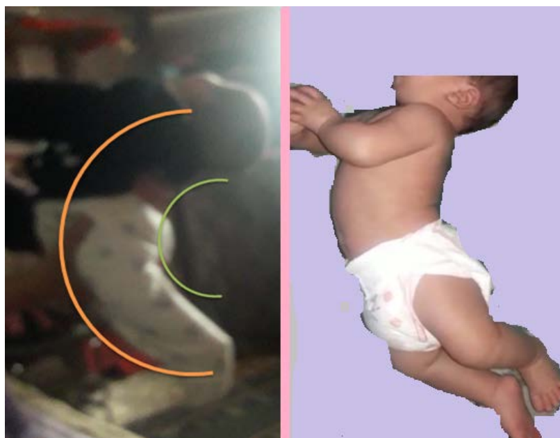
Figure 1. The attack of spasmodic torsional dystonia with arching of the back and rigid opisthotonic posturing, mainly involving the neck, back, and upper extremities.

A 3-month-old male infant has attended our emergency department with a history of bizarre head and neck movements (extension of the head with neck, chest with abdomen contraction and extension to the back, both upper and lower limbs arched with increased the tone, associated with irritability). The attack lasts for about 3 minutes, started since birth, not associated with loss of consciousness, eyes not fixed during the attacks, no aura or postictal state (Figure 1).