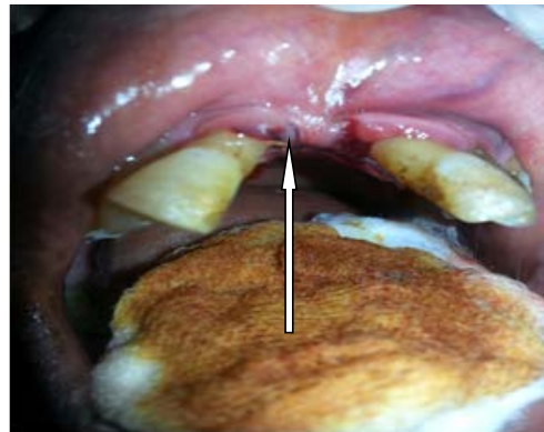
Figure 2. Mouth cavity after biopsy-excision.