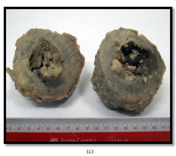
Figure 1. Unilocular hydatid cysts from slaughtered animal: (a) fertile cyst; (b) sterile cyst; (c) calcified cyst.