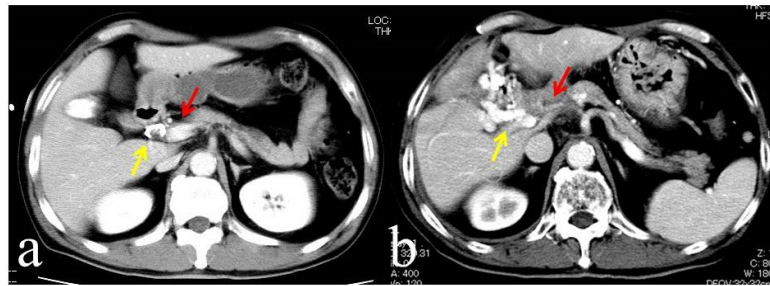
Figure 2. (a) A percutaneous transhepatic biliary drainage tube (yellow arrow) was inserted into the common bile duct. The preoperative diameter of the PV was normal (red arrow); (b) CT revealed jejunal varices in the hepatic hilum (yellow arrow) and PV stenosis (red arrow).