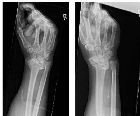
Figure 2. X-Ray right wrist (pre ORIF)—showing a displaced and comminuted intra-articular fracture of the distal radius.

the right medial femoral condyle and there was a laceration on the anterior aspect of knee. On clinical examination there was no instability found and all the tendons were intact. After washing the knee laceration with 0.9% of normal saline in the A&E setting, the laceration was covered with Jelonet gauze dressing and a hinged knee brace was applied with full range of motion.