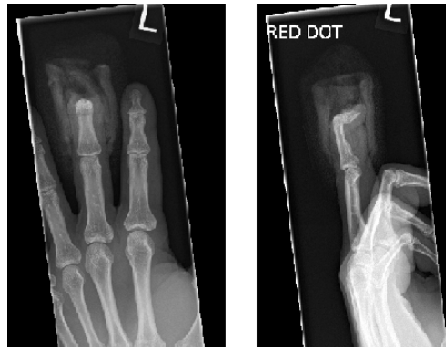
Figure 1. XR left hand: Amputation through the distal phalanx of the middle finger.