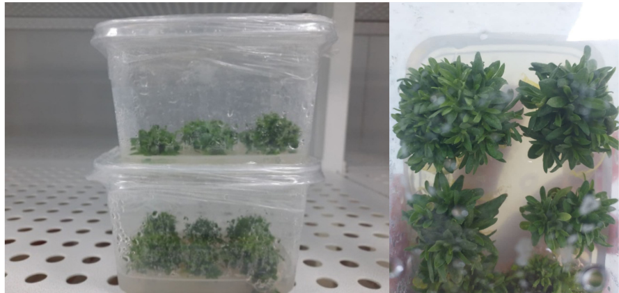
Figure 3. H. maracandicum seedlings.