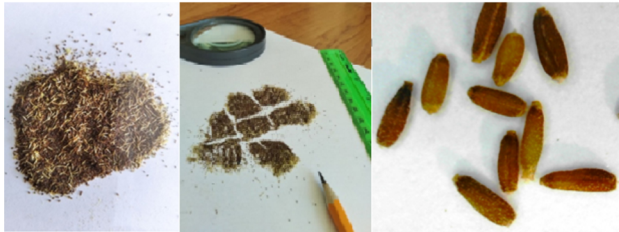
Figure 1. Selection of seeds of helichrysum maracandicum popov ex kirp.

Firsova's method [15]. According to the literature, the germination of freshly harvested seeds is higher when growing medicinal plants from their seeds [10]. Well-matured annual seeds of H. maracandicum were selected for our studies (Figure 1).