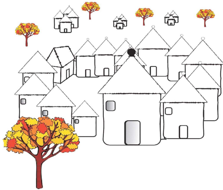
Figure 1. Drawing of a Dagomba compound with the different traditional houses.

his parents. Everyone in the compound is considered a family as they usually eat from the same pot. The women each have a day or week to prepare food for the whole compound. The main entrance is usually meant to entertain guest. The household head's house is close to the entrance and that of his last wife. The rest of the family is found in the middle of the compound. Food and livestock are stored close to the entrance on the left side of the compound. The power dynamics are evident with the household head building taking a central stage to all activities in the compound. The size of the farm usually reflects the availability of family labour. The Dagomba families are large and range from 6 - 20 people. Intercropping and mono-cropping were both practised by farmers. Cereals and rice were usually planted on the same land, and never rotated with other crops. Legumes, cereals, and vegetables were intercropped in the compound or backyard farms.