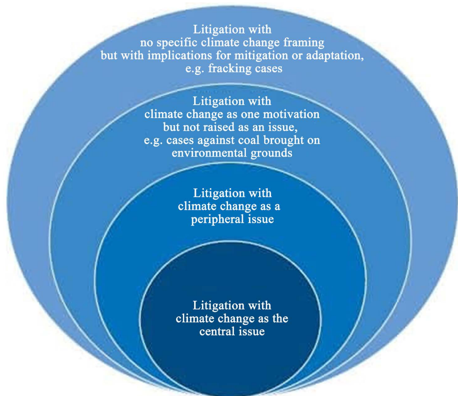
Figure 1. Legal notions climate litigation.

Adopting a narrower definition of climate litigation, which focuses on judicial cases and targeted adjudications involving climate change, as a central legal