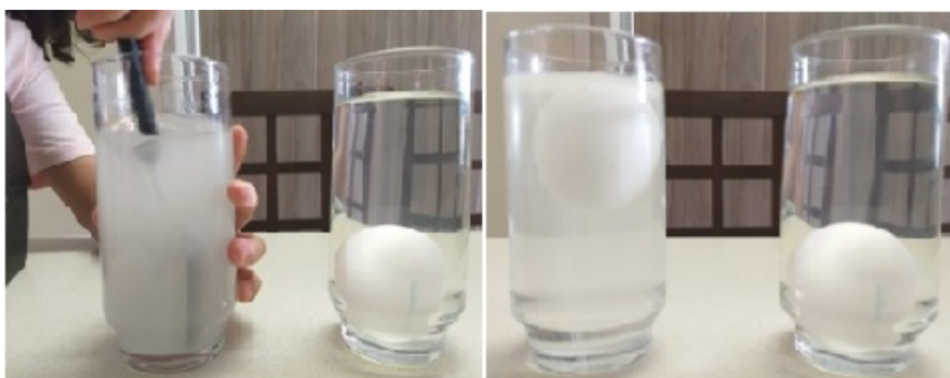
Figure 4. Density activity of solids and liquids.