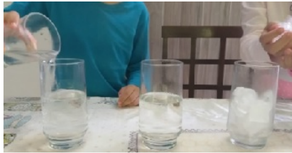
Figure 8. Physical state of water activity.