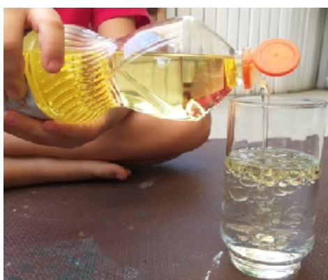
Figure 5. Heterogeneous system activity.