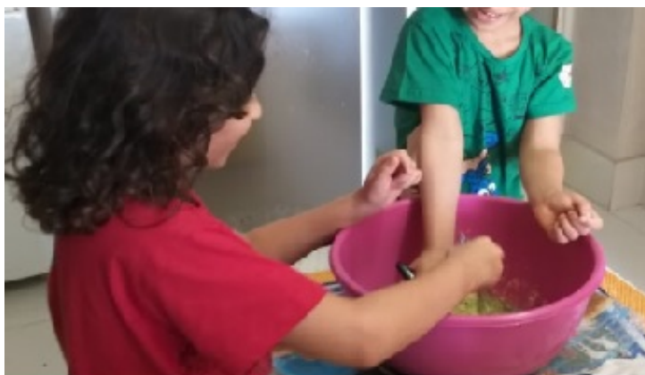
Figure 6. Homogeneous system activity.

The activity carried out was the preparation of a cake by the children, from which it was possible to observe that the mixture of ingredients, associated with cooking, causes a chemical reaction and modifies the cake's ingredients, due to changes in color, flavor, odor and consistency. In this activity, during mass mixing, the concepts of homogeneous and heterogeneous systems were taken up ( Figure 7 ).