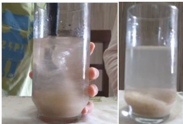
Figure 10. Decanting activity.