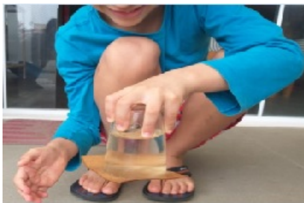
Figure 9. Pressure activity.