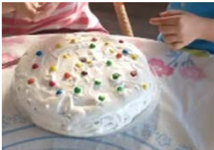
Figure 7. Chemical reaction activity.