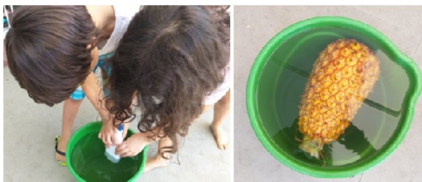
Figure 2. Density activity of solids.

It is worth mentioning that the children were free to select different liquids and ended up observing that some of these substances mixed with others, due to their density. Despite of this observation be useful to reinforce the concept of density of liquids with the HA/G s, this fact caused discomfort on part of the participants-advisers, probably due to the unexpected outcome. This discomfort was interesting to perceive as this is a common feeling on HA/G teachers that are caught by surprise with the acts and explanations of this public. This common behavior of these students requires further thinking and explanations and sometimes further preparation and studying from these teachers to attend them.