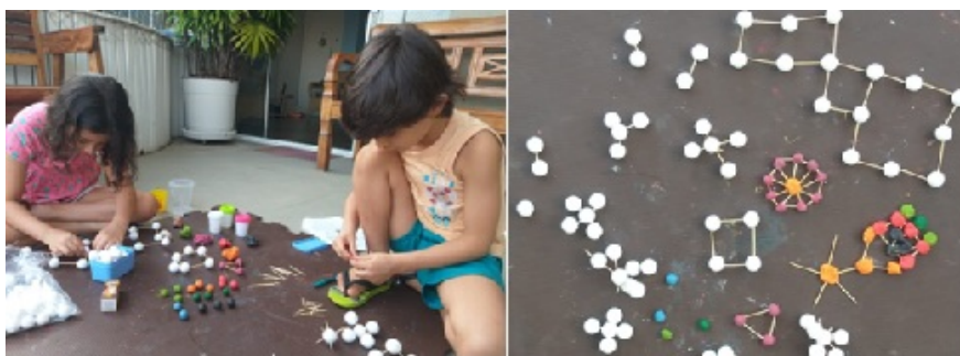
Figure 1. Atoms and molecules activity.