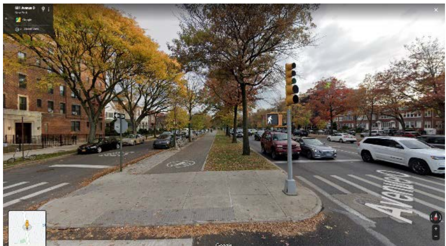
Figure 2. Octavia Multiway Boulevard, San Francisco.