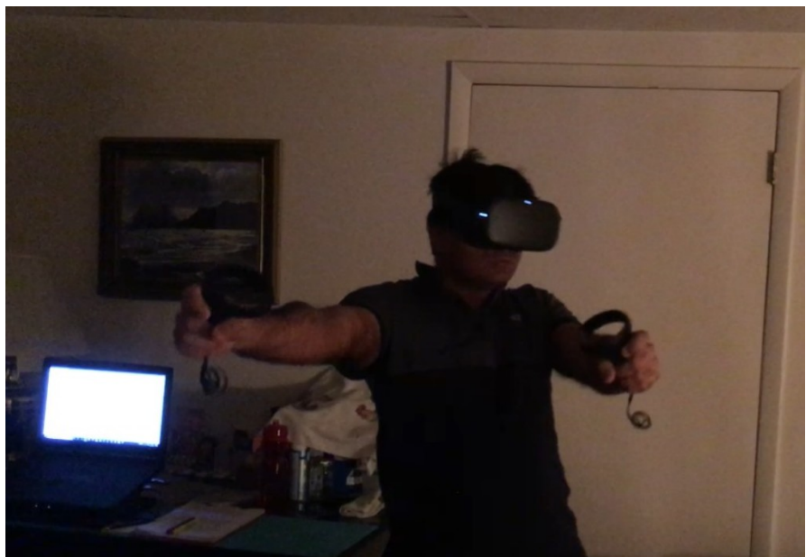
Figure 2. The use of SOP through virtual reality by using oculus quest.

The symbiotic link between SOP adherence and increased overall efficiency became startlingly apparent beyond the context of mistake reduction. The study's discriminating lens captures a landscape where the application of SOPs catalyzes a smooth and well-choreographed dance of production aspects, eventually