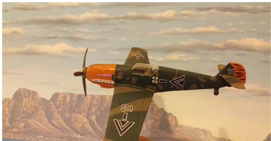
Figure 1. A model of the Messerschmitt Bf 109.

The Messerschmitt as depicted in Figure 1 above is together with its famous pilot, and focus of this article is responsible for the most air kills during World War II. Table 1 below provides a complete list of the top-ranking aces of World War II according to their number of kills. The particular aircrafts that were flown in during the kills are also detailed.