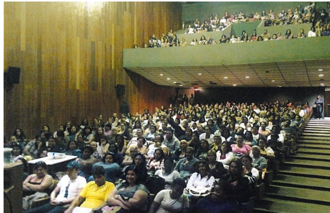
Figure 1. Hall fully crowded with participants in one of the “Obese Workshops”.

We considered as patients with dyslipidemia the people who manifested an altered value of CT, HDL, LDL, TG and BMI between 35 and 39.9 kg/m and greater than or equal to 50 kg/m [18]. In the “Obese Workshops”, during the lectures, the participants were always reminded that wherever a scalpel passes, there will always be a scar. Even so, almost everyone preferred the scar rather than the excess fat and skin. After the preliminary Workshop, that is, the one with more than 300 participants, we selected those who were already at the ideal weight, to undergo the Reconstructive Plastic Surgery. This surgery was only accomplished after they underwent a series of tests and passed all of them. We indicated only one surgery at a time, that is, when we accomplished a mastoplasty, we did not associate it with abdominal dermolipectomy or liposuction. With this decision, we never had a death or serious infections, which could cause any harm to the patient. We are aware that, after six hours of the open wound, it is considered contaminated.