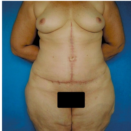
Figure 4. Postoperative front view.