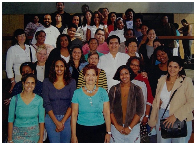
Figure 5. The joy on the participants' faces after their conquests.

operation at a time. Each surgical time was a maximum of 3 hours. Patients were followed up for one year [21].