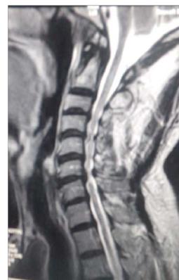
Figure 1. MRI of the cervical spine, sagittal T2 sequence. Cervical-arthritis myelopathy following compressive (extradural) herniated discs.