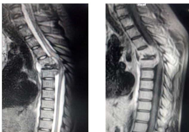
Figure 4. MRI of the thoracic spine sagittal sequence T1 and T1 gado. Acute T4-T5 spondylodiscitis with compressive anterior epiduritis and parietal abscess.

At the end of this work, MRI showed good diagnostic sensitivity to the medullary both lesion and topography. This analysis was based on MRI semiology (morphological and signal).