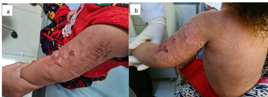
Figure 4. Erysipelas of the left MS in a 23-month-old girl showing the evolution before treatment (image a) and after (image b).

The gateway is often identified when it is actively sought, which is the case in 67% - 72% of cases in the literature [4] [5]. The main recognized entry points in erysipelas affecting the lower limbs are as follows: Interdigital intertrigo, skin wounds, pre-existing dermatoses such as psoriasis, boils, impetigo, particularly when they are pruritic, erosive dermatoses (eczema, chickenpox), insect or arthropod bites, venous ulcers of the lower limb [6], which is consistent with the results of this work. Other factors, notably locoregional factors such as venous insufficiency, which can facilitate dermo-hypodermal dissemination of the pathogen, are relatively rare in pediatric cases [7]. Lymphedema can manifest as primary or secondary in origin [8]. General predisposing factors include diabetes, obesity, use of nonsteroidal anti-inflammatory drugs and corticosteroid therapy, whether administered systemically or topically, nephrotic syndrome and primary or acquired immune deficiencies [9] [10]. None of the cases in this work have these risk factors.