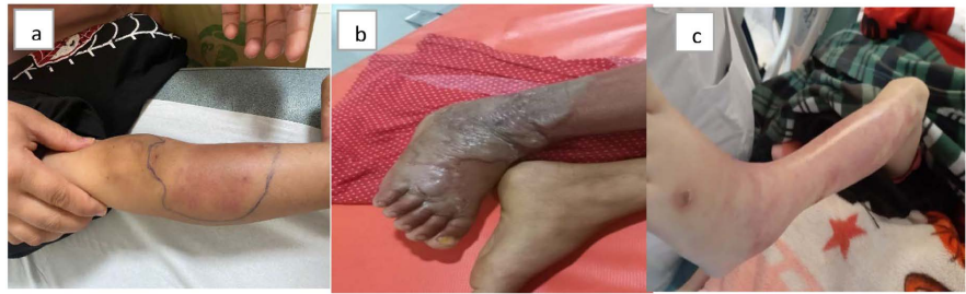
Figure 1. Photos (a, b, c): Images of erysipelas in children in our series.