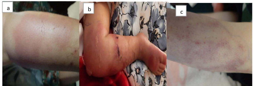
Figure 3. Photos of patients in our series showing the different types of erysipelas: (a) Erythematous appearance; (b) Bullous appearance; (c) Purpuric appearance.

progression before hospitalization varied between 2 and 7 days. Biologically, a blood analysis revealed leukocytosis predominantly neutrophils (PNN) with values varying between 13,500 and 22,400 elements/uL in 15 patients. C-reactive protein (CRP) was elevated in 17 children, with values ranging from 45 mg/dL to 130 mg/dL. Three children had negative CRP, probably due to taking antibiotics before admission.