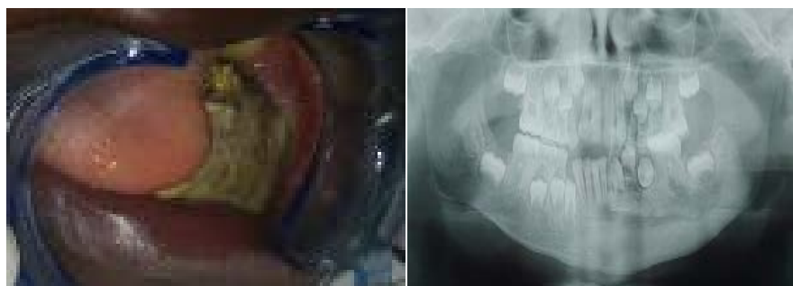
Clinical oral view