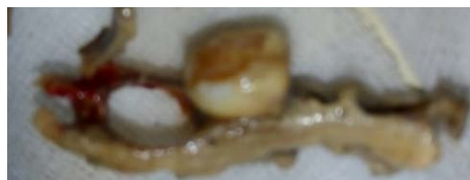
Bone sequestration with 36