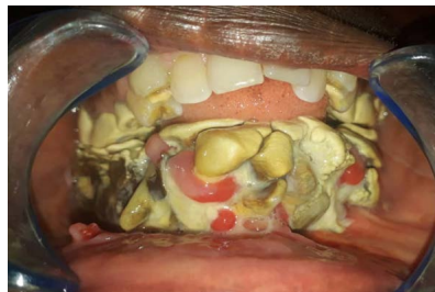
Clinical oral view