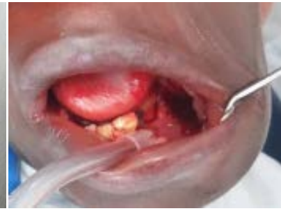
Clinical view after sequestrectomy