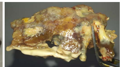
Voluminous bone sequestrum