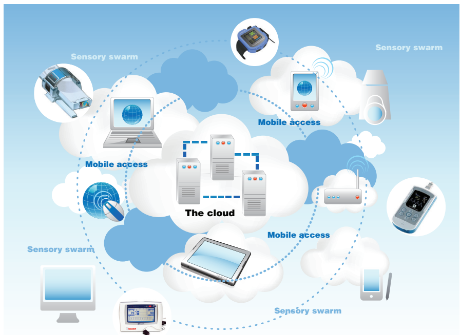
Figure 1. The swarm around the cloud.

While the number of nodes already linked to the cloud is huge, adding up to billions of units, it is dwarfed by the potential number of these new ULP systems that are starting to come