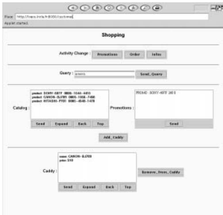
Figure 2: Example: The client user interface