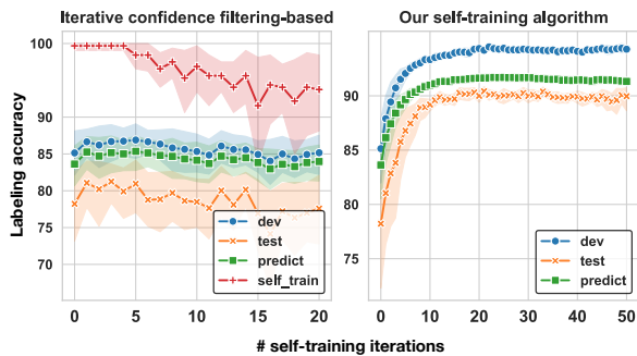
Figure 3: On the SST-2 sentiment dataset, traditional confidence filtering-based self-training (left) yields poor results compared to our approach, which trains on all pseudo-labels at each iteration (right).

Figure 3, which shows the labeling accuracy (% of unlabeled examples that are labeled correctly) on the development set ( dev ), the test set ( test ), and the unlabeled data pool ( predict ) of the SST-2 sentiment dataset. In the iterative confidence filtering-based approach (left plot), a fixed number (in this plot, 32) of most confidently labeled examples are added to the labeled set \mathcal{L} at each iteration (the self-train line shows the labeling accuracy of these examples); once they have been added, they are not removed, and this process is repeated until the unlabeled set \mathcal{U} is exhausted. As can be seen, this approach works well for the several first self-training iterations (3-5), but then labeling accuracy begins to degrade. In contrast, our algorithm (right plot) gradually and consistently improves labeling accuracy before converging at some iteration. These results suggest that strong base models benefit from including even significantly noisy pseudo-labels in self-training, as opposed to training on a narrow distribution of high-confidence predictions.