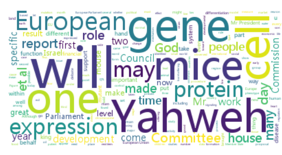
(b) The training set data of two tokens