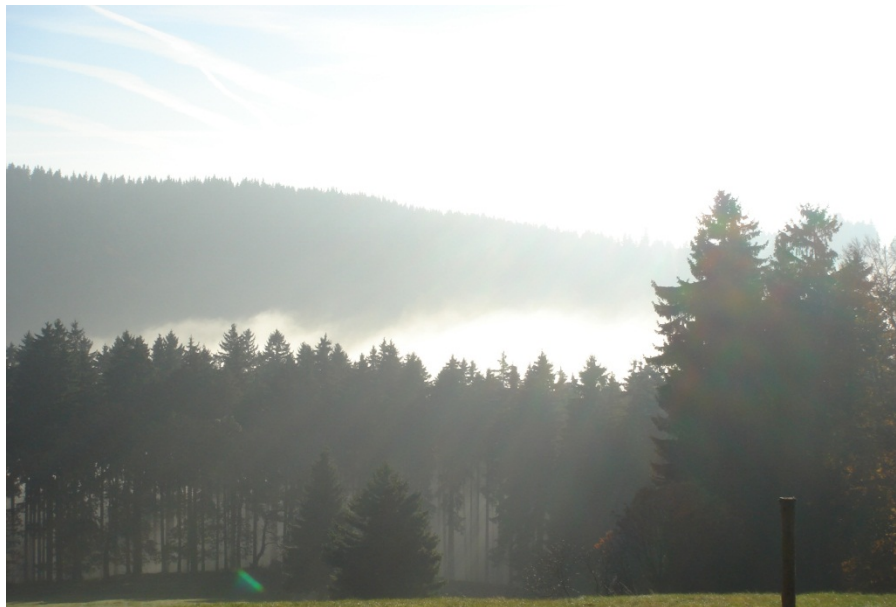
The photo taken in Gehlberg station