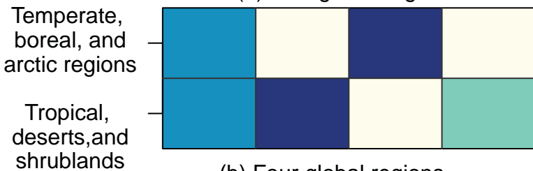
(b) Four global regions