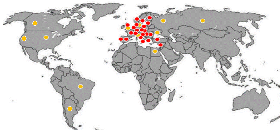
Figure 2. European COST countries EuMetChem members (red dots) and other institutions (yellow dots) contributing with their expertise to the COST Action ES1004 EuMetChem.